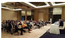
ECU GENERAL ASSEMBLY 2016