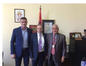
ECU A & SERBIAN MINISTRY OF SPORTS MEETING IN BELGRADE